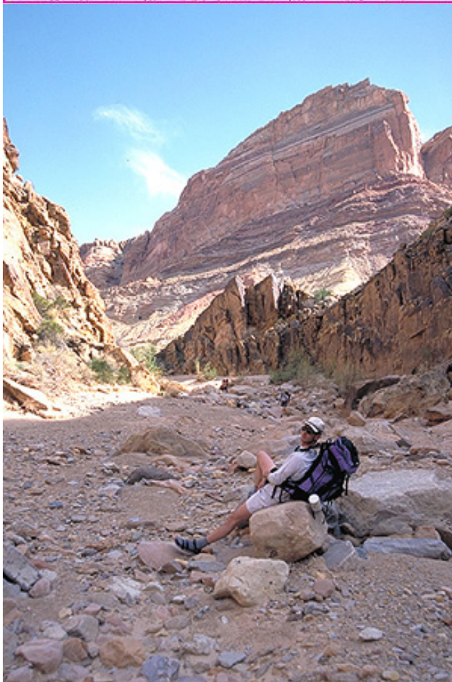
Joe Smith kicking back in Lower Straight Wash